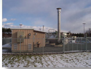
Metering and Regulating Station

Metering and regulating stations are installations containing equipment to measure the amount of gas entering or leaving a pipeline system and, sometimes, to regulate gas pressure.