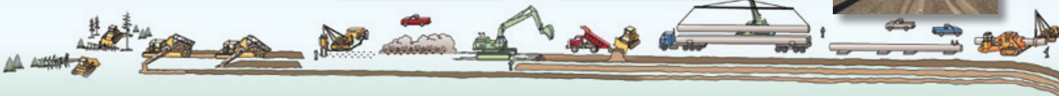
Clearing and grading