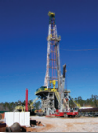
Well drilling rig

A: Underground natural gas storage can be used to balance the load requirements of gas users. Storage fields are the warehouses that provide a ready supply of natural gas to serve the market during periods of high demand.