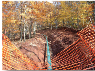
Pipeline in trench

A trench is a long narrow ditch dug into the ground and embanked with its own soil. They are used for concealment and protection of pipeline. Trenches are usually dug by a backhoe or by a specialized digging machine.